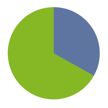
Fixed Income Breakdown